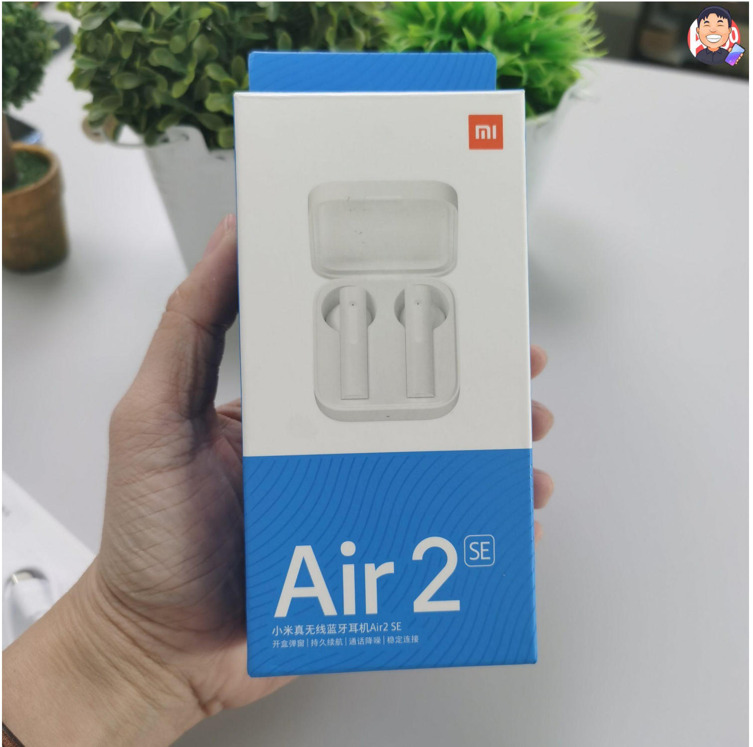
Sinst Bluetooth earphones packaging boxes Process