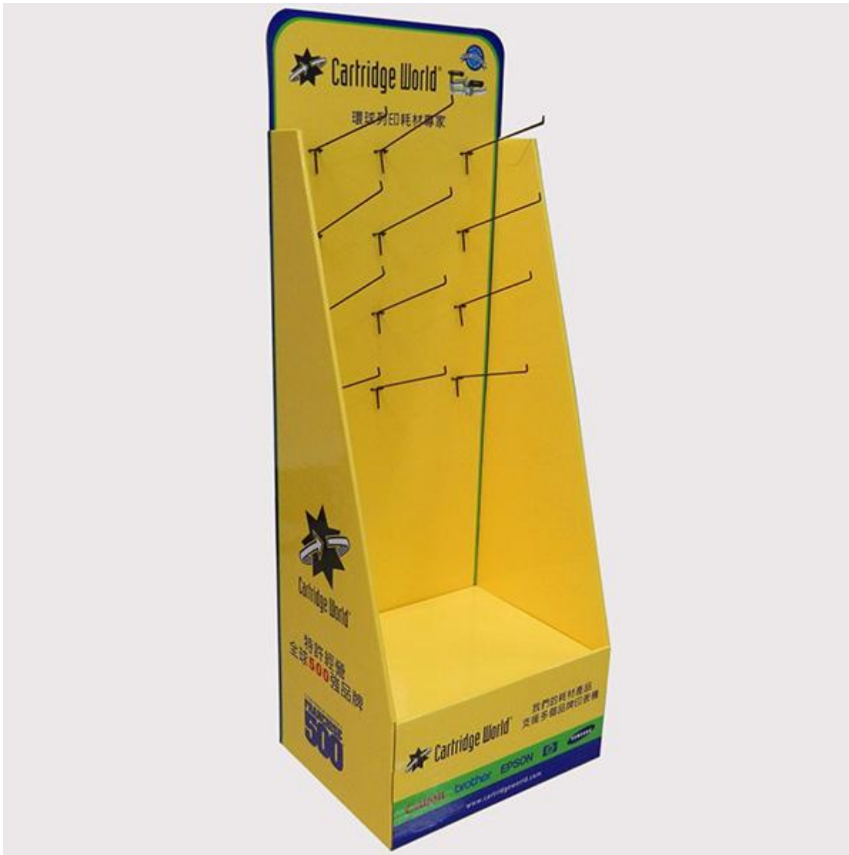
Sinst Paperboard 4 Tiers Display Stand for Clothing Process